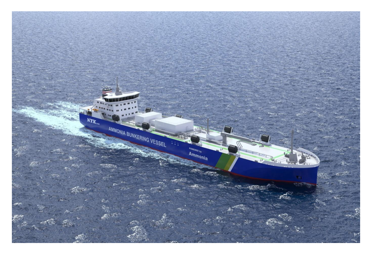
Illustration of the Ammonia-Fuelled Ammonia Bunkering Vessel (AF-ABV) designed by LMG Marin.